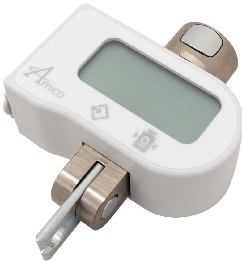
GO-LIFT-SCALE-ASSY Class 3 Scale: GO-LIFT-SCALE-EU-ASSY