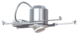
Low Profile Directional (LPD) LED Downlight