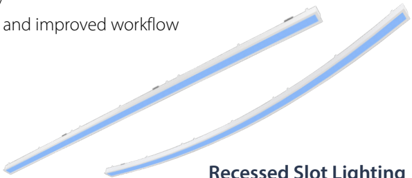
Recessed Slot Lighting