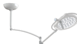
Single Ceiling Mount