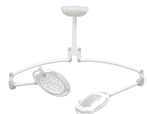
Dual Ceiling Mount