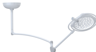
Single Ceiling Mount