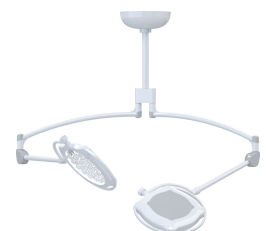
Dual Ceiling Mount