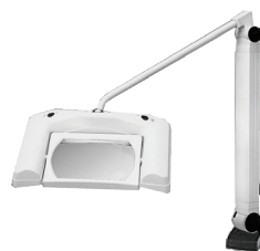
Magna 9 LED