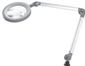
Magna 51 LED