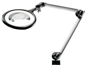
Magna 50 LED

Amico's LED magnifiers are designed to make demanding visual tasks easier with a wide-angle, distortion-free lens and premium LEDs to illuminate the viewing area for precise and consistent examinations.