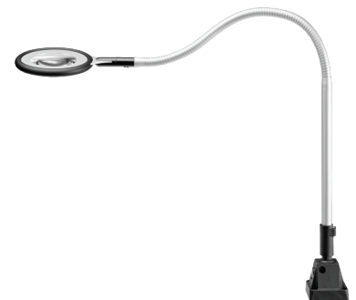
Magna LED Gooseneck