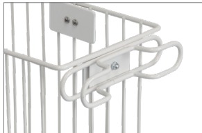
Plate for mounting your sanitizer dispenser